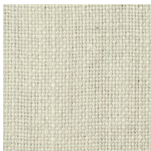
02 - MARFIL