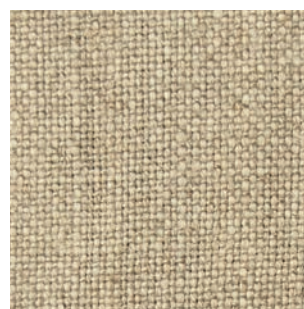
04 - NATURAL