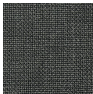
18 - ANTRACITA