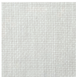
01 - BLANCO