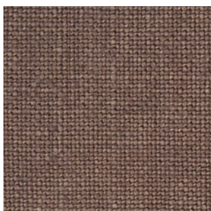
07 - CAFE