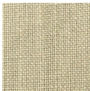
03 - GRIS